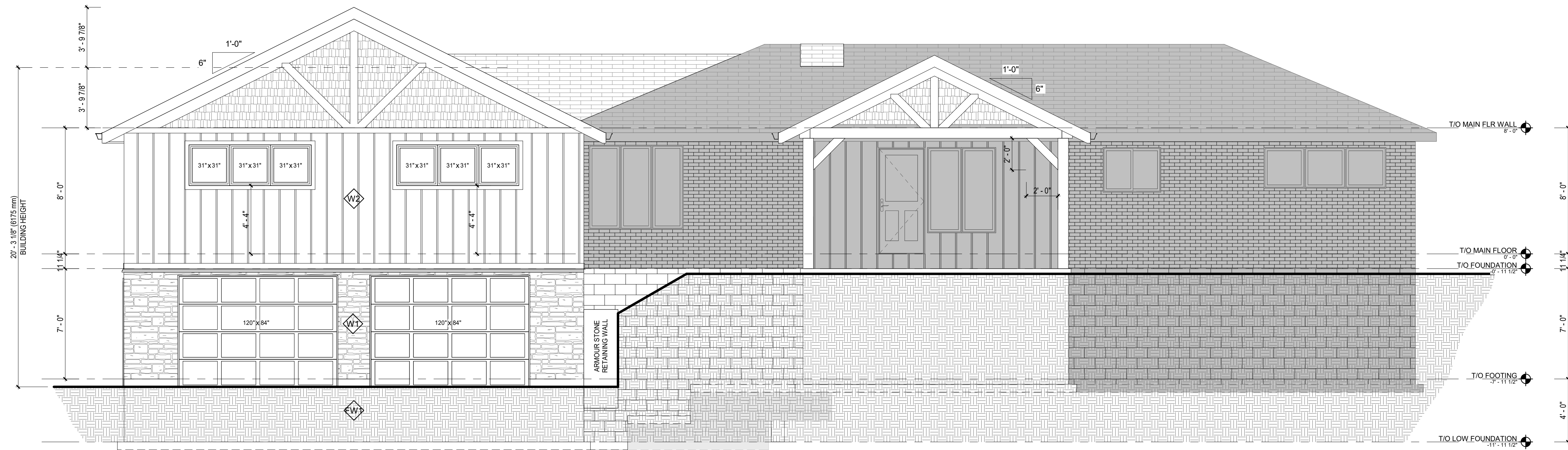
1 SOUTH BUILDING ELEVATION A4.0 1/4" = 1'-0"